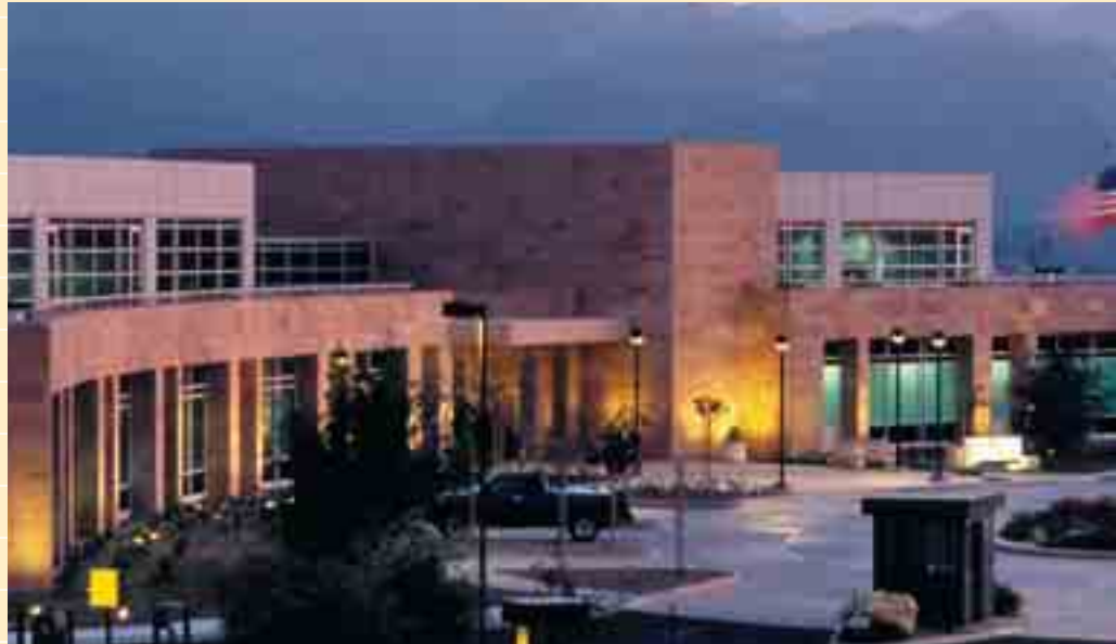
The Wellpoint Executive Center in Thousand Oaks, Calif., combines natural sandstone veneer-faced panels and precast to create a strong horizontal rhythm that blends into the hilltop.

There are three primary options for installing stone veneer: on studs, on steel strongback or on precast. All offer a more cost-effective solution than solid stone. Because the backs aren't visible in the final product, the choice of backing for the stone veneer is not an aesthetic one but one of function, economy and schedule.