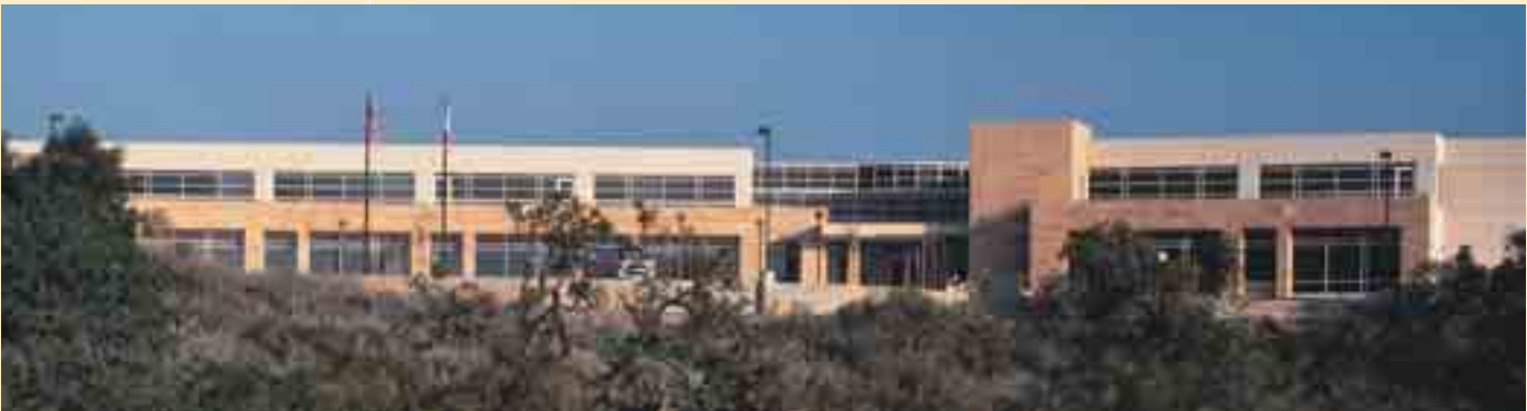
The precast panels used in Wellpoint's Executive Center were custom-matched in both color and texture to the stone veneer.

Of the installation choices—hand set, stone on steel strongback system and stone on precast—we selected stone on precast for two reasons. First, it was the most cost effective. Second, it offered ease of coordination with the other precast components it touches, providing a good method to get a true secondary-seal weather joint, an important consideration with Seattle's rainy weather.