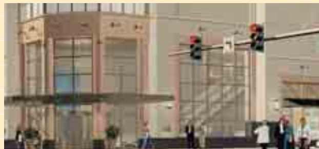
Stone veneer at the base of the 1700 Seventh Ave. building in Seattle adds an appropriate contextual detail.

For a retail building under construction in downtown Chicago, we used a combination of stone cast into the precast panels and field-set stone. The building features precast construction with glass curtain wall, with the stone detail supplying richness of texture and color. Working in a climate with freeze-thaw conditions, panels prefabricated with the stone in place solves many of the problems of working in cold weather.