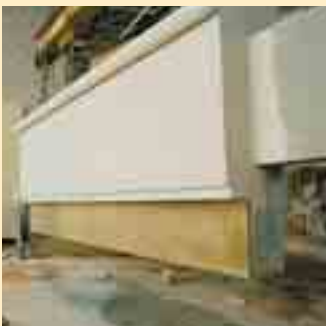
This detail view shows stone veneer on precast that was used as a window surround.

the rest of the building, stone veneer was used as window surrounds and medallion details of a feature stone higher up, applied one per panel. While these could have been either field-set or prefabricated, it was much easier to cast them in the plant.