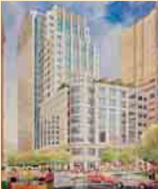
Faced with snowy conditions on Chicago streets, this department store uses a dark granite veneer base to provide a durable, easily maintained surface.