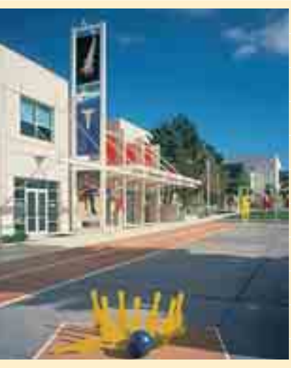
The Sports Medicine & Technology building and the new Sports Exhibition Center entrance feature horizontal and vertical reveals designed to work in conjunction with major building openings and the vertical and horizontal precast fins that create an entrance canopy.

A unique application came with the Aquatic Center and Gymnasium. These are large structures, with spans of 110 feet and no exterior windows due to the client's need to control light for filming events. Our design strategy created a diagonal pattern of deep reveals within the precast panels that carried around all four sides of the building's main mass. At the building's edge, the diagonal pattern disappears to create a large, smooth area for placement of the Olympic symbols. These photographs show how the