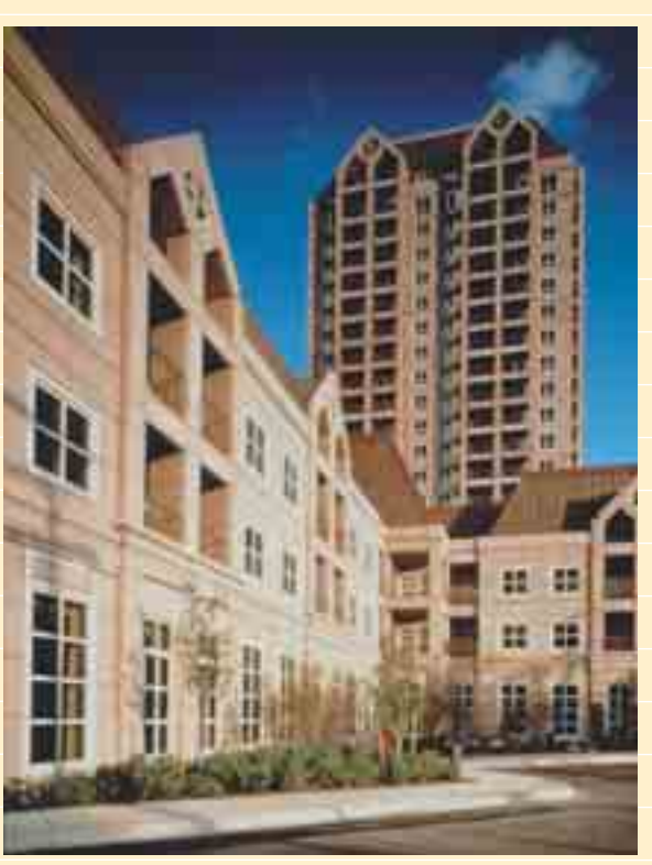
The USAA Retirement Center in San Antonio features precast concrete throughout the façade. Window panels on the low-rise structures highlight a variety of profiles and treatments, as do the balconies and window areas of the tower of the project.

Whether window wall panels span column-to-column or floor-to-floor, the repetition of design affords the same repetition for attachment and erection. This contributes to the panels' economy and speed of erection.